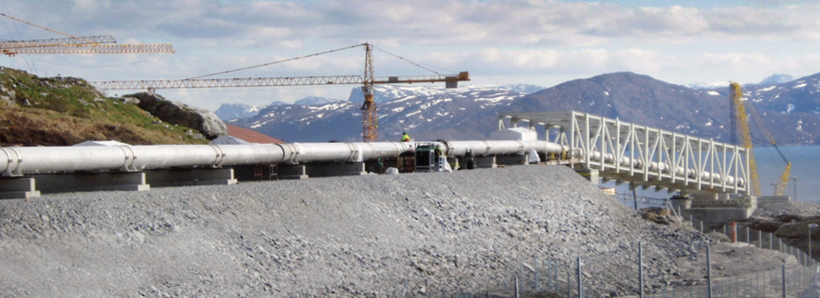
1 600 m of BUTTING pipes – the flareline for the project Snøhvit